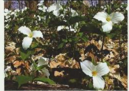
Trillium grandiflorum , the official wildflower of Raccoon Creek County Park